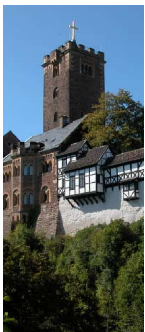
St. Stephen's Lutheran Church